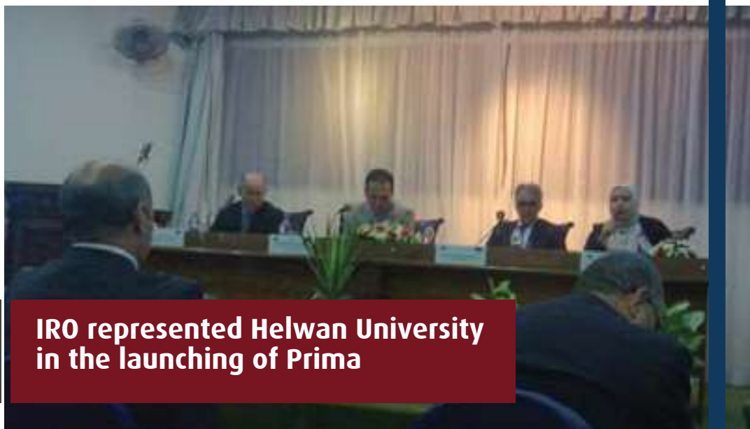
IRO represented Helwan University in the launching of Prima